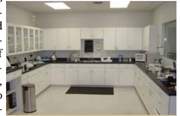
FruitSmart®'s Fully-Equipped Laboratory

FruitSmart® also prides itself on the high level of service we provide our customers. From comprehensive real-time post production project reporting, to international sourcing of ingredients, we work to provide our customers with the best possible quality and price. Our staff is fully prepared to meet your needs and provide you with “world-class” service. Please give us a call.